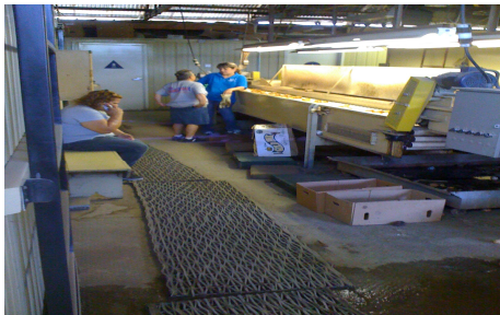
Great For Anywhere People Are Standing!

We all want comfort especially when working long hours. Save the back; save the legs! Non-slip, when working near wet areas.