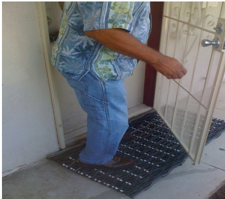
Use your mats for outdoors or indoors.