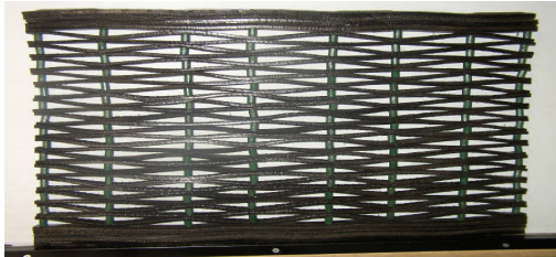
Typical Utility Mat